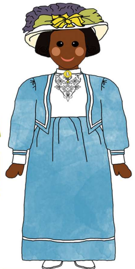
Madam C.J. Walker started a business and became the first female millionaire in the US!