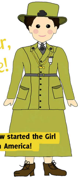
Juliet Gordon Low started the Girl Scouts in America!