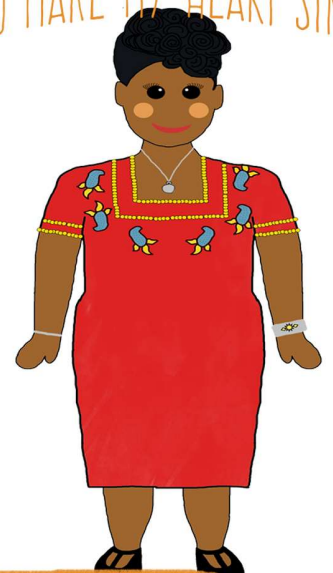
Ella Fitzgerald was a world famous musician!