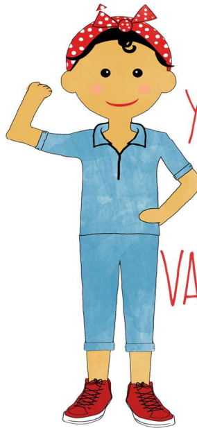
Marie Curie discovered radium, which made things like X-rays possible.