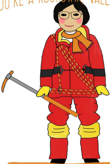
Junko Tabei was the first woman to climb Mount Everest!