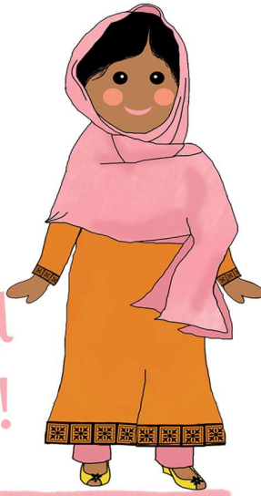
Malala Yousafzai is the youngest-ever Nobel Peace Prize winner.