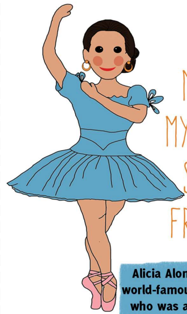
Alicia Alonso was a world-famous ballerina who was also blind.