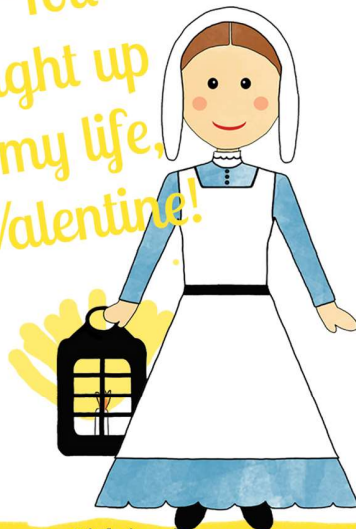
Florence Nightingale was a nurse who made hospitals better and saved millions of lives!